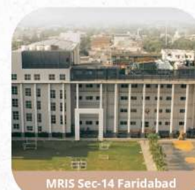
MRIS Sec-14 Faridabad