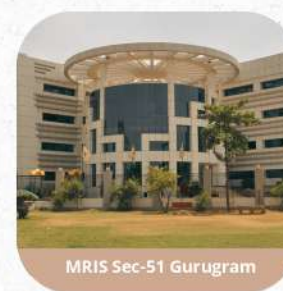
MRIS Sec-51 Gurugram