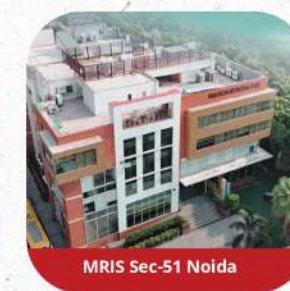
MRIS Sec-51 Noida