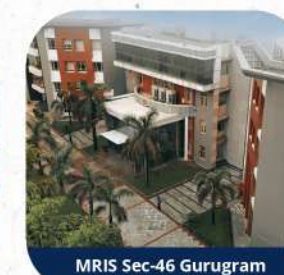
MRIS Sec-46 Gurugram