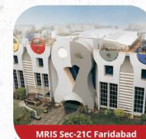
MRIS Sec-21C Faridabad